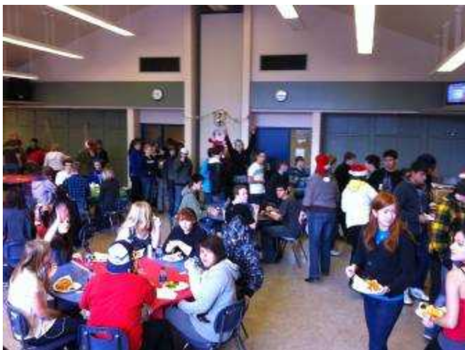
Students enjoying Christmas lunch.