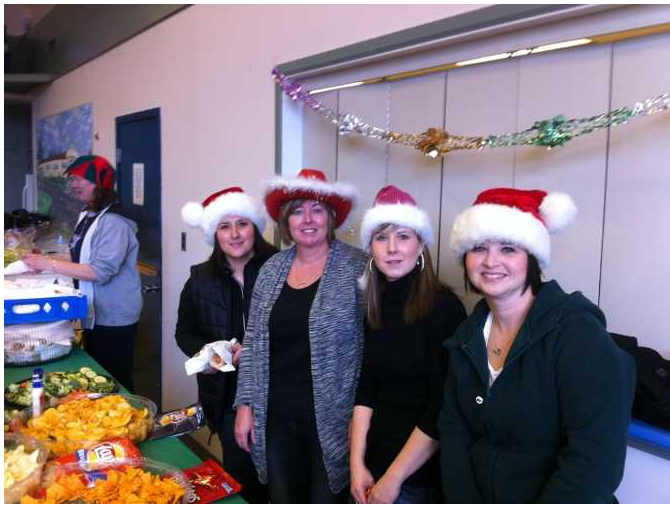
PAC parents serving Christmas lunch.

NISS Drama Club will present "A Night in Elsinore" at 7:00 p.m. on January 13 th and 14 th . See you there!